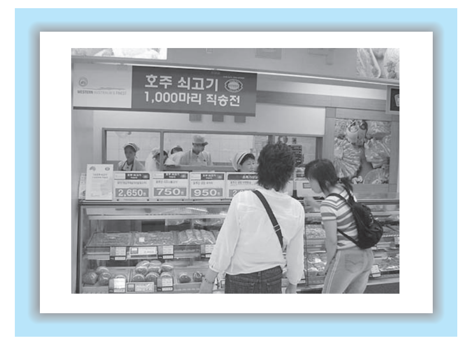
Figure 8.3 Western Australian meat merchandised in Korea

position new products in these preferred positions sales will be positively influenced (Figure 8.3).